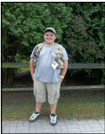
Youth raffle winner