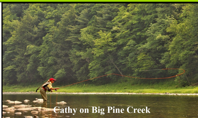
Cathy on Big Pine Creek