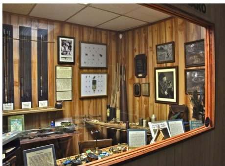
Vince Marinaro Exhibit Room