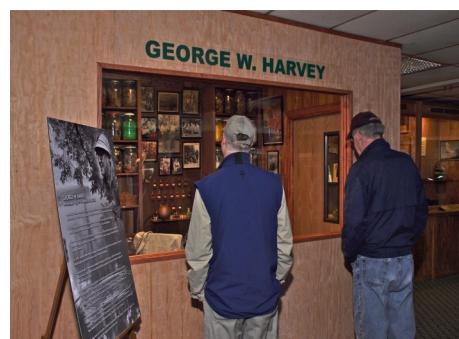
George Harvey Exhibit Room