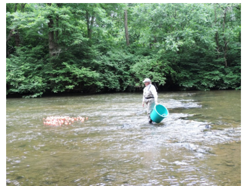
MJ starting the Fish Swim