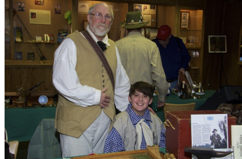
The Colonial Angler