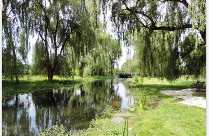
The view looking upstream to Shady Lane