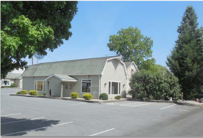
The new building at 101 Shady Lane Carlisle, PA 17013

We are very excited to announce that the PFFMA has moved into it's new home. After much hard work by many great volunteers, the PFFMA has transported and reassembled the exhibits to our new building along the Letort Spring Run. The address is 101 Shady Lane Carlisle, PA 17013. Renovations are underway and the museum will be ready for the 5th Annual Open House on April 7th and 8th from 9am to 5 pm. The property boasts significant access to a section of the Lower Letort and a nice meadow for event activities. After our Open House weekend, the PA Fly Fishing Museum will be closed for one week for remodeling. It will officially reopen on April 17 and the hours of operation will be 9am to 6 pm daily. See page 3 for more information.